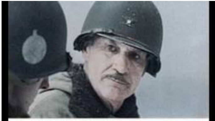
(Above) As Col. Robert Sink in "Band of Brothers"; (Left) As CPT Harris in "Platoon"; (Below, from left) in "Casualties of War", "Saving Private Ryan" and "Outbreak"